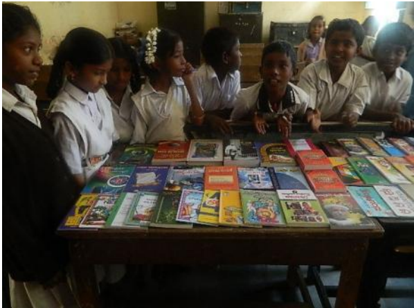
Read Library Project Books at Government School Malleshwaram, Karnataka