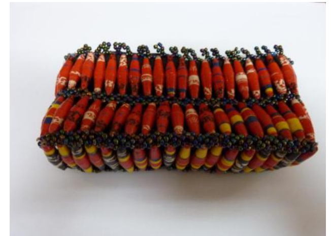
Clutch Bag from the new handicraft project we are supporting in Uganda