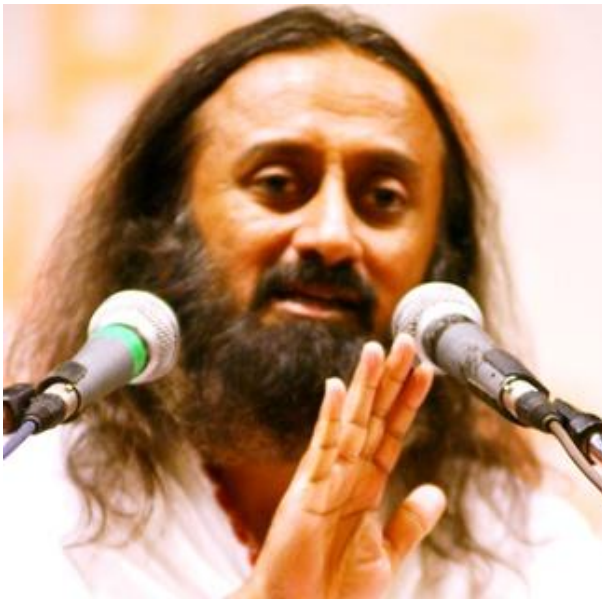
HH Sri Sri Ravi Shankar the principal Founder and head of IAHV worldwide

Sri Sri Ravi Shankar, the leader and founder of IAHV, teaches that human values such as caring, generosity, tolerance and respect, are inherent within us, but are overshadowed and blocked when we become tired, stressed and experience imbalance in our lives. These values flourish when we are energetic, relaxed and centred. He gives us 7 steps to bring us Inner Peace and bring out our inherent human values.