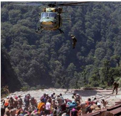
Rescue in Uttarakhand

We take the opportunity of the delayed publishing of this report to include details of this Summer 2013 Uttarakhand initiative