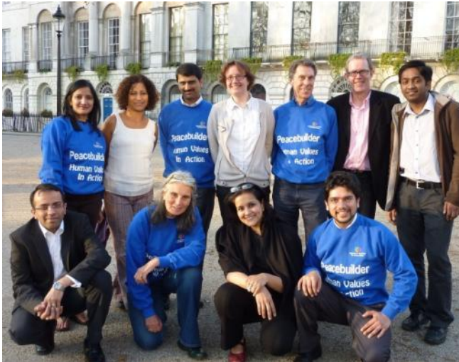
Peacebuilders and Volunteers at the IAHV Peacebuilding Meeting on 23 April 2013