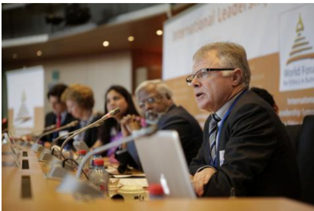
WFEB at European Parliament in Brussels December 2012

WFEB holds Symposia around the world to focus on these issues and promote Ethical dealing as an effective, and profitable alternative to corruption for the good of all. Two key events from this programme are featured below.