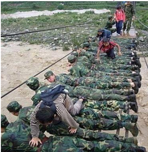
Rescue by the Army in Uttarakhand Style – Getting across on the backs of soldiers!