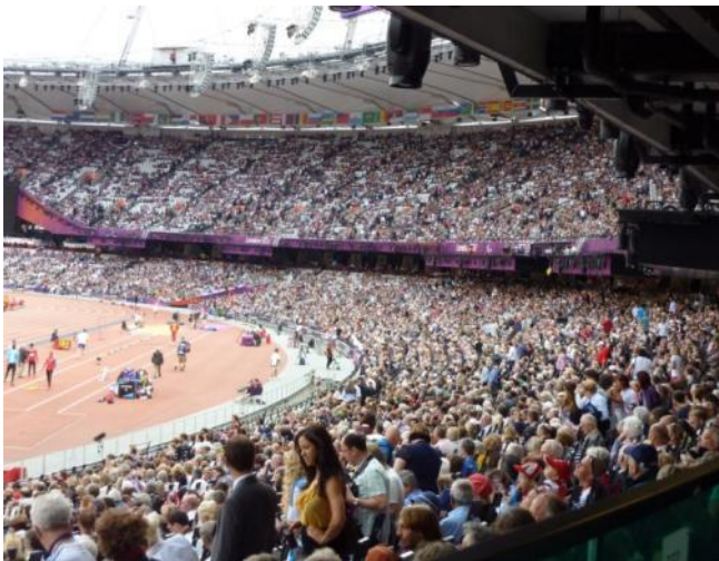
80,000 capacity crowd at the amazing London 2012 Paralympics