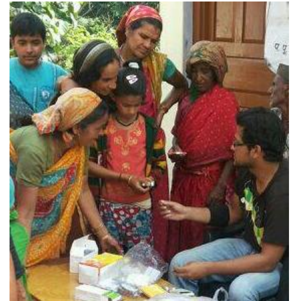
Uttarakhand Floods – Medical Camp at Chandrapuri Village June 2013

This Peacebuilding programme offers a new approach, with considerable scope to make a very positive impact into the existing Peacebuilding industry. This addresses the deeper personal needs of the individuals targeted, to enhance the possibility of successful outcomes in the focus areas. It is early days on this, but we have hopes for the future.