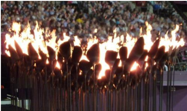
London 2012 - Connection made to millions of people Worldwide through the Olympic Flame