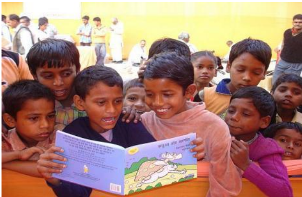
The Joy of Reading at School in India