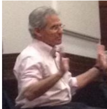
Jon Kabat-Zin in London on 28 March 2013

Where Ghandi once spoke, at the Friends Meeting House, Euston Road, London, the writer Jon Kabat-Zin set out why mindfulness should be a part of our daily lives, on 28 March 2013 in front a capacity audience.