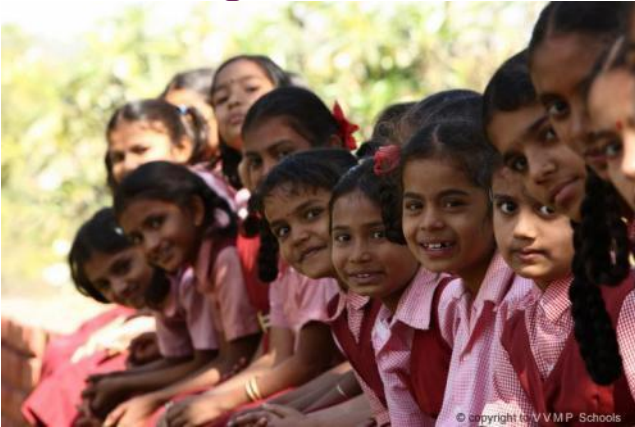
Children at a Gift A Smile supported School

Because there is still no public schooling in their villages, the free schools we support in India represent the only opportunity for children to acquire an education. Internationally, IAHV is supporting Gift A Smile, which provides education for under-privileged children mainly in India.