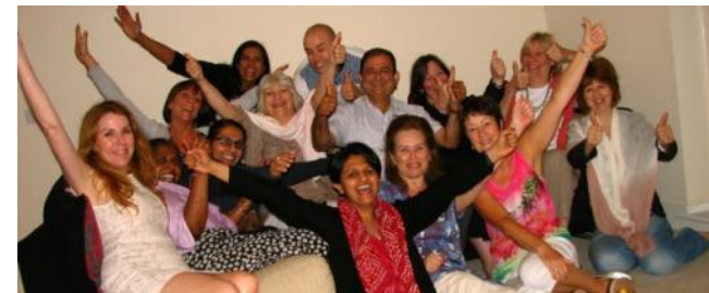
All smiles amongst MYM Volunteers showing the results of the de-stress programme

Our aim is to continue providing this service into 2014 and we hope that our collaboration with local authorities, healthcare professionals, organisations and individuals within the community will continue making a positive lasting difference.