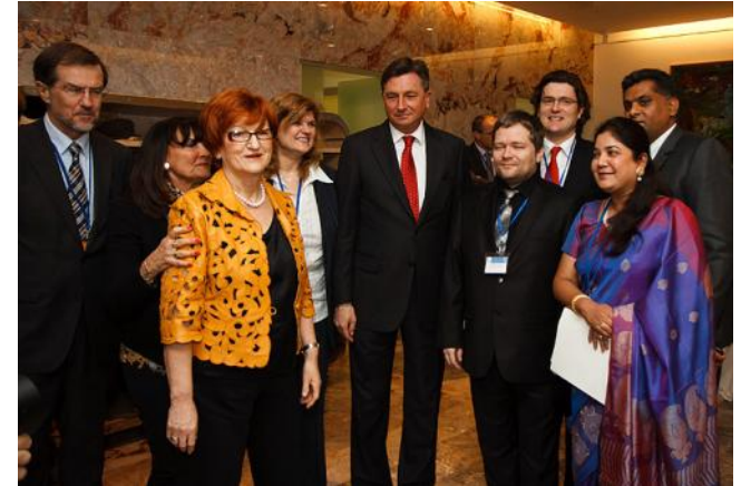
Organisers and speakers at the Slovenia conference.

In the context of the widespread public and student protests in Slovenia against the corruption of the 'elite' and politicians there. IAHV and the World Forum for Ethics in business held a Symposium on 22 March 2013 at IEDC - Bled School of Management. They were searching for an answer to the question of finding the leadership styles that would help avoid future crises and provide sustainable, long-term growth. Participants agreed that one of the most important solutions is an ethics and leadership style that brings not only progress but also trust.