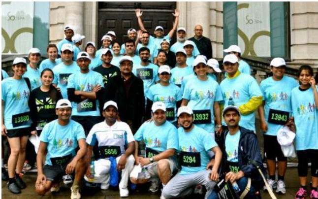
Some of the 108 runners who took part in the July 2012 London 10kFun Run – who raised an amazing £26,226