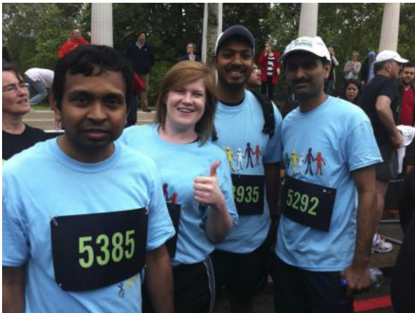
IAHV competitors ready for the 'off' in the British 10K

Special thanks are due to all these people who have really helped to move IAHV UK forward so significantly.