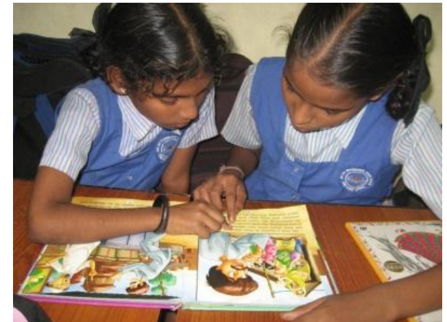
Read Library Project at Sri Sri Ravi Vidya Mandir, Dharavi, Mumbai

Sri Sri Ravi Shankar, the founder of IAHV 28 October 2013