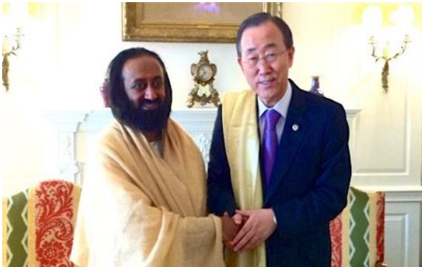
Sri Sri Ravi Shankar with the Secretary-General of the United Nations Ban Ki-moon in March 2012