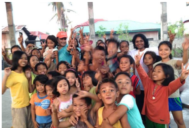
A big welcome for the Disaster Relief effort IAHV UK supported in the Philippines