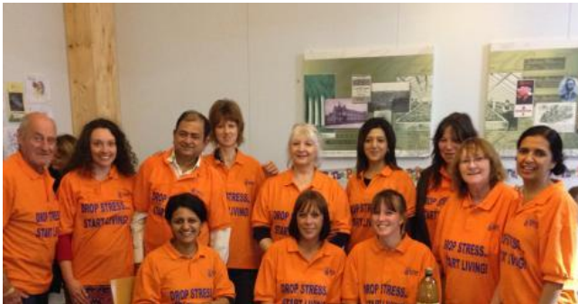
MYM Volunteers on duty at Quiz Night 2014 – which also raised nearly £1,000