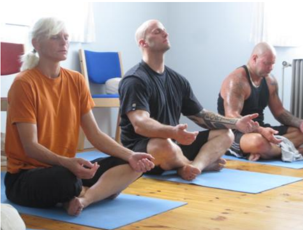
Prison SMART is achieving outstanding results

Prisons are some of the most stressful places on earth. A key aim within prisons is supposed to be rehabilitation, so that people come out fit to participate in society. In practice, in most countries, it is a revolving door, where once offenders have been to prison, there is a high probability that they will end up back inside. With Prison SMART, the aim is to make a real difference. In an increasing number of cases, Prison SMART is effective and inmates are genuinely empowered to change and engage with society without reoffending.