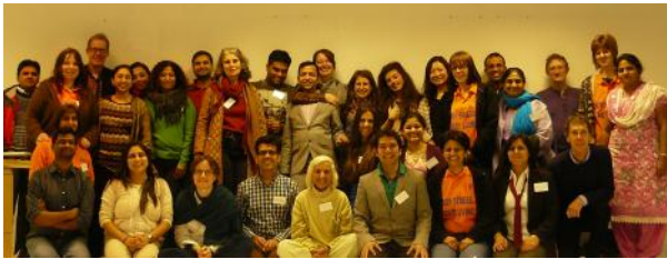
Volunteers at the IAHV UK Annual Volunteers Meeting in London, January 2014