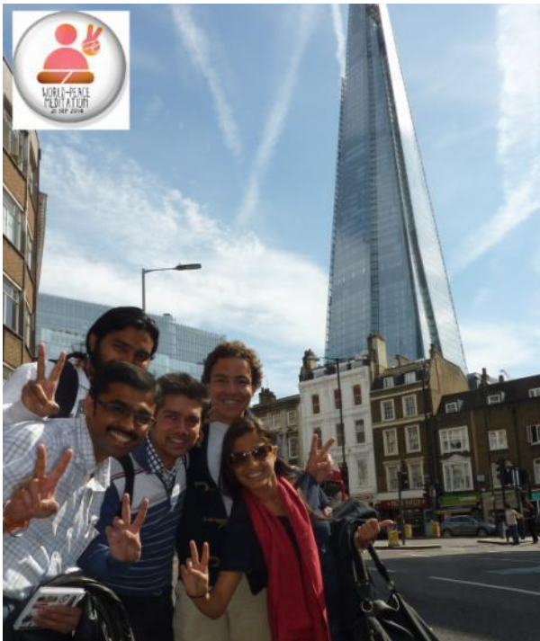
Selfies were big in 2014 – and this one for the World Peace Meditation is next to the tallest building in the UK, the Shard at London Bridge