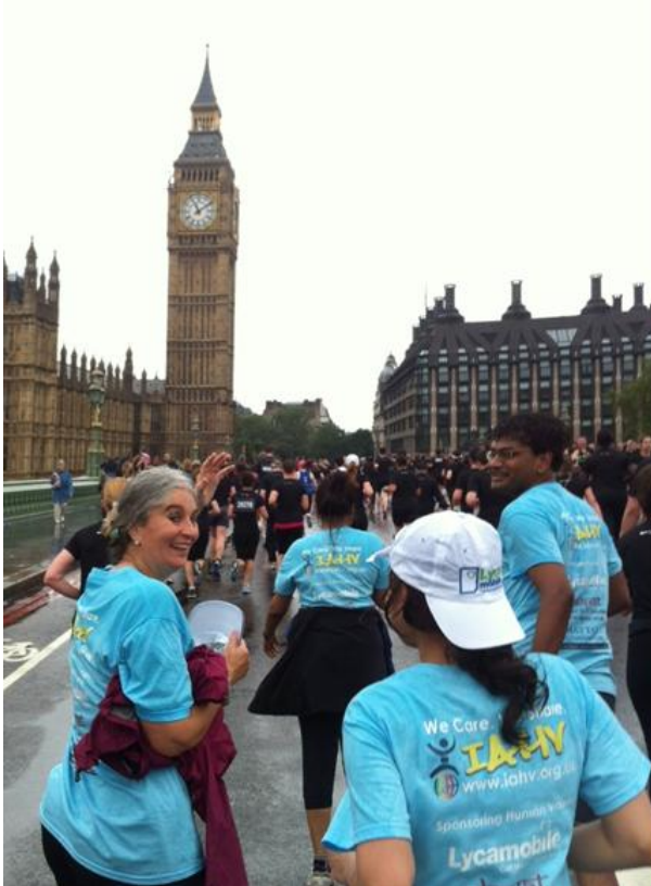
London 10k Fun Run in July each year is our main fundraising event