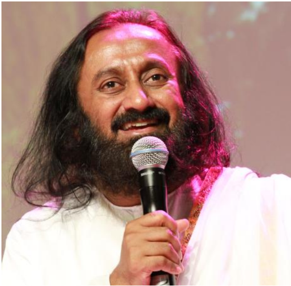
HH Sri Sri Ravi Shankar the principal Founder and head of IAHV worldwide

Sri Sri Ravi Shankar is the principal founder and head of IAHV worldwide. The following are extracts from an article appeared in the Huffington Post in December 2013.