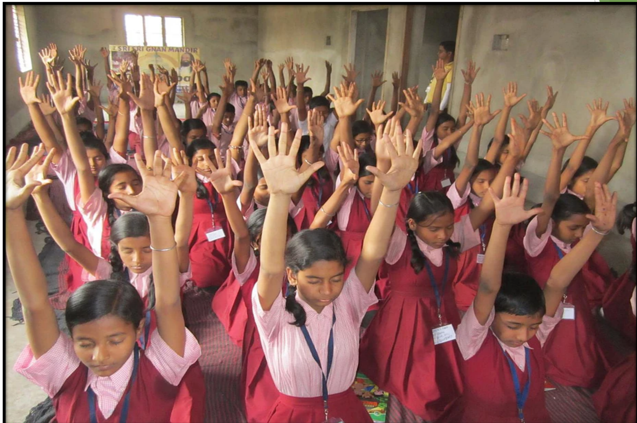
Art excel - holistic teachings