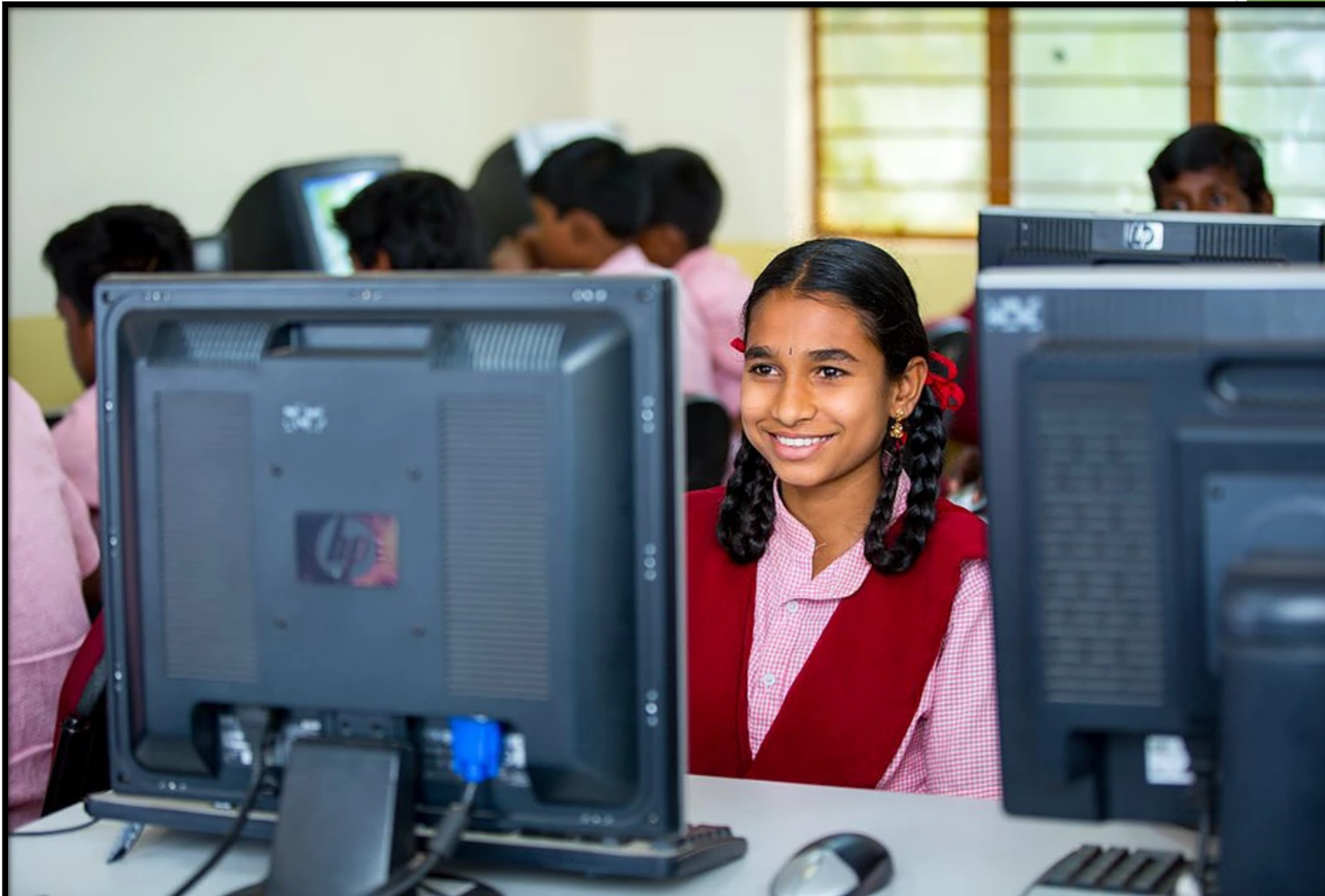
School Computer Lab